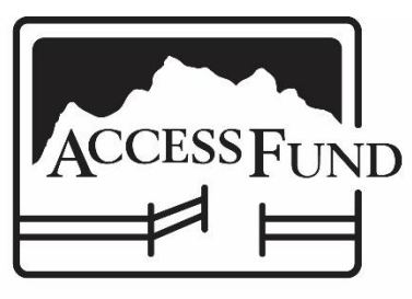
Protect America's Climbing

study. In terms of total jobs, the largest sectors are in restaurants, general retail, grocers, and sales at gasoline stores (both food and fuel).